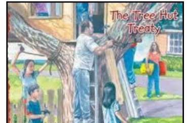
The Treaty Hut Treaty (Copies sent to schools 2006)

Four children decide to create a treaty outlining the use of their tree hut. Introduces the concepts behind the Treaty of Waitangi, and includes a facsimile of the Treaty.